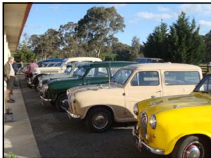
Lineup outside the motel