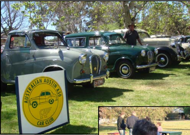
Our lineup of A30's on the bank of Seven Creeks