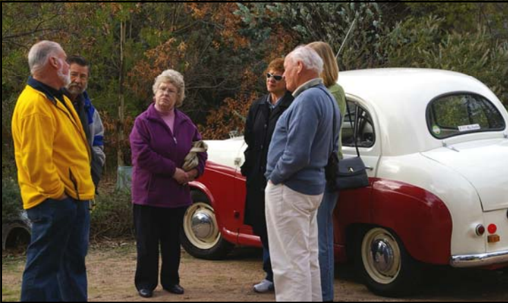
Seen in the WOOP WOOP car park.