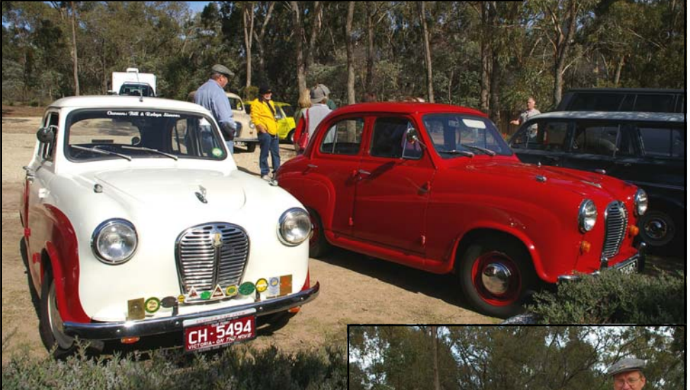
The Simons's 4 door from Echuca and the Stenbens's 2 door from Shepparton.