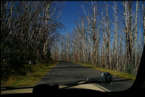
Above the Snowline