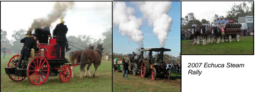
2007 Echuca Steam Rally

Please come along and support your Club.