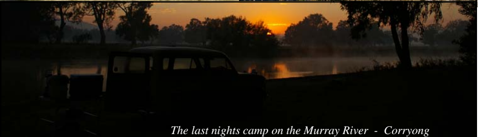
The last nights camp on the Murray River - Corryong