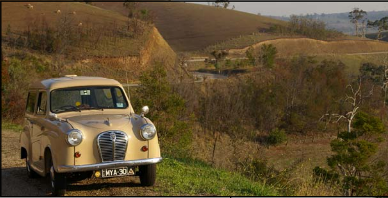
Climbing north out of Buchan