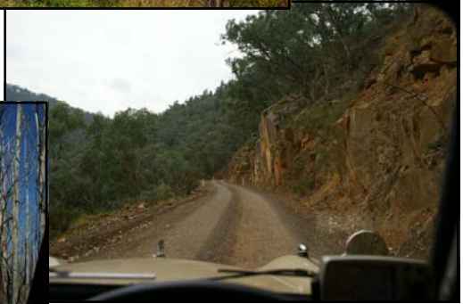
Another great A30 road